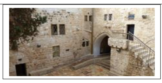
A Family Gives Their Home Maundy Thursday Service March 28 – 6:00 pm